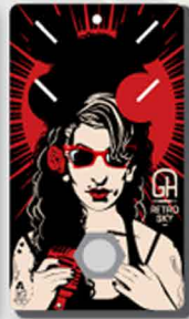
"RETRO SKY" DELAY