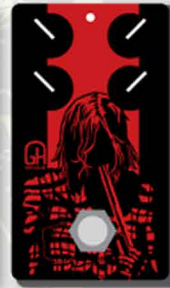
"NO BRAINER" DISTORTION