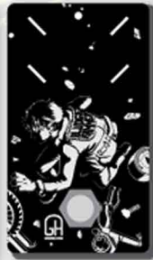
"SLUDGE HAMMER" SLUDGY FUZZ